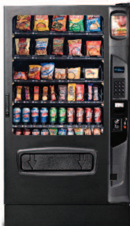
Shown with kick panel option.